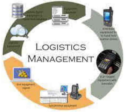
Figure (2):- Logistics Management

Logistics is an essential component of supply chain management. It involves the planning, carrying out and management of goods, services, and information from the point of origin to the point of consumption. Logistics aligns the complex pattern of traffic and transportation, shipping and receiving, import and export operations, warehousing, inventory management, purchasing, production planning, and customer service. Companies see logistics as a critical blueprint of the supply chain. It is used to manage, coordinate and monitor resources needed to move products in a smooth, timely, cost-effective and reliable manner. <sup>[6, 7]</sup>