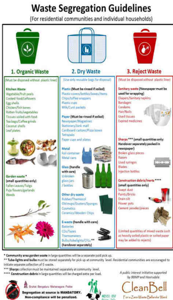
Figure3: Sample pamphlet that can be stuck on the dustbins by the manufacturing industries -

7.2.2 Waste collection by the Collectors: Municipal waste Collecting vehicles and privately owned waste collectors need to be partitioned proportionately their vehicles and rickshaw as per the color codes (for green and red waste).on the back side of the vehicle/rickshaw a bag will be hanged to collect recycled waste. Safai-karamcharis who sweep streets will be responsible for collecting just brown waste from parks and roadsides which includes shredded leaves, hay, woody chips, and twigs and carry them to nearby receptacles. Difficult part is sorting of waste as it is will be way easier by this method(not 100% but still it will reduce pressure on landfills and incinerators(if used) which are meant for organic waste and rejected waste. Remaining Recycled waste will reach to its destination since they are sold to junk dealers undoubtedly by the people which are bought by industries. In this way sorting of waste will be maintained in the midway and hence